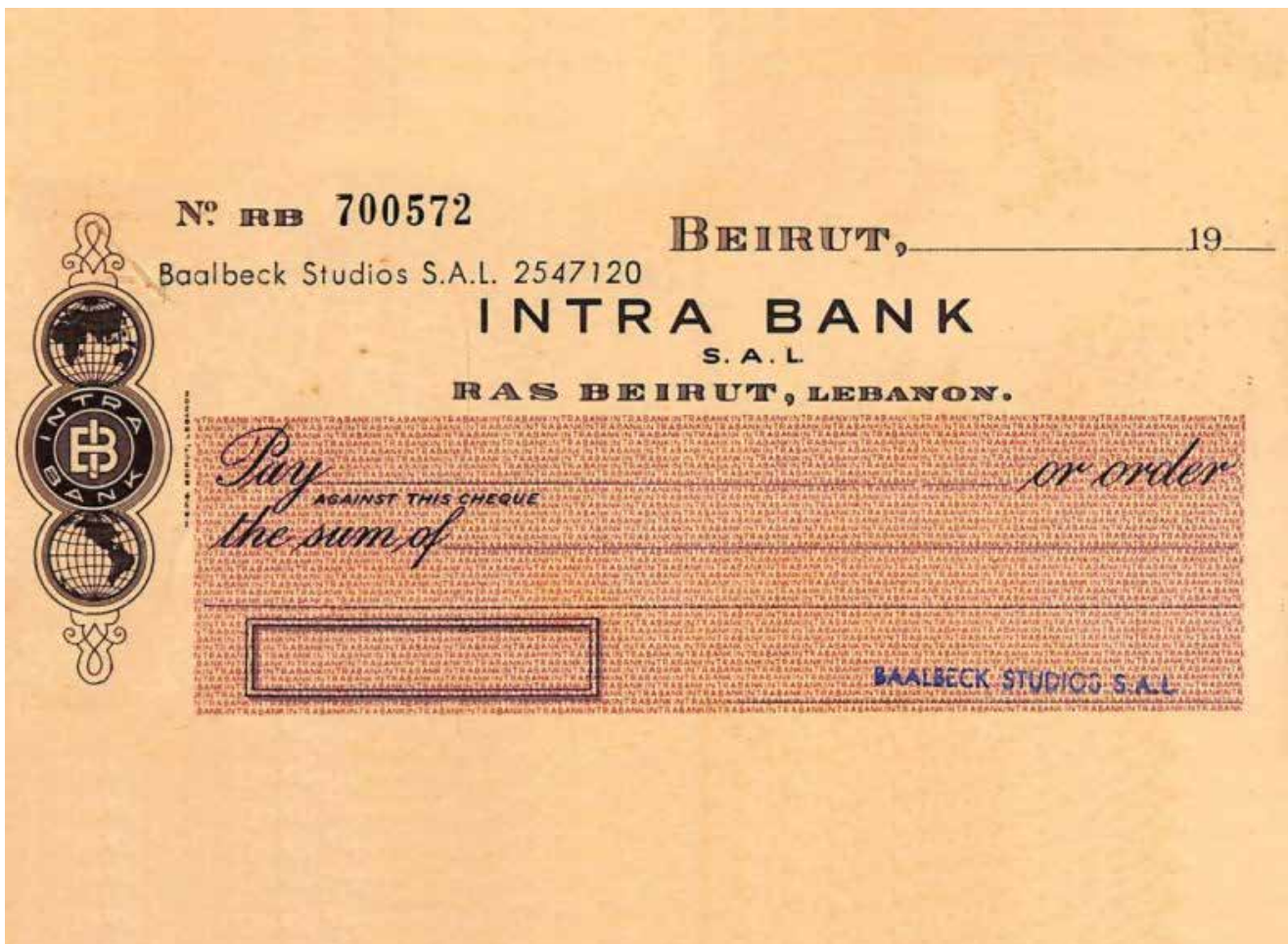
Check issued by Intra Bank