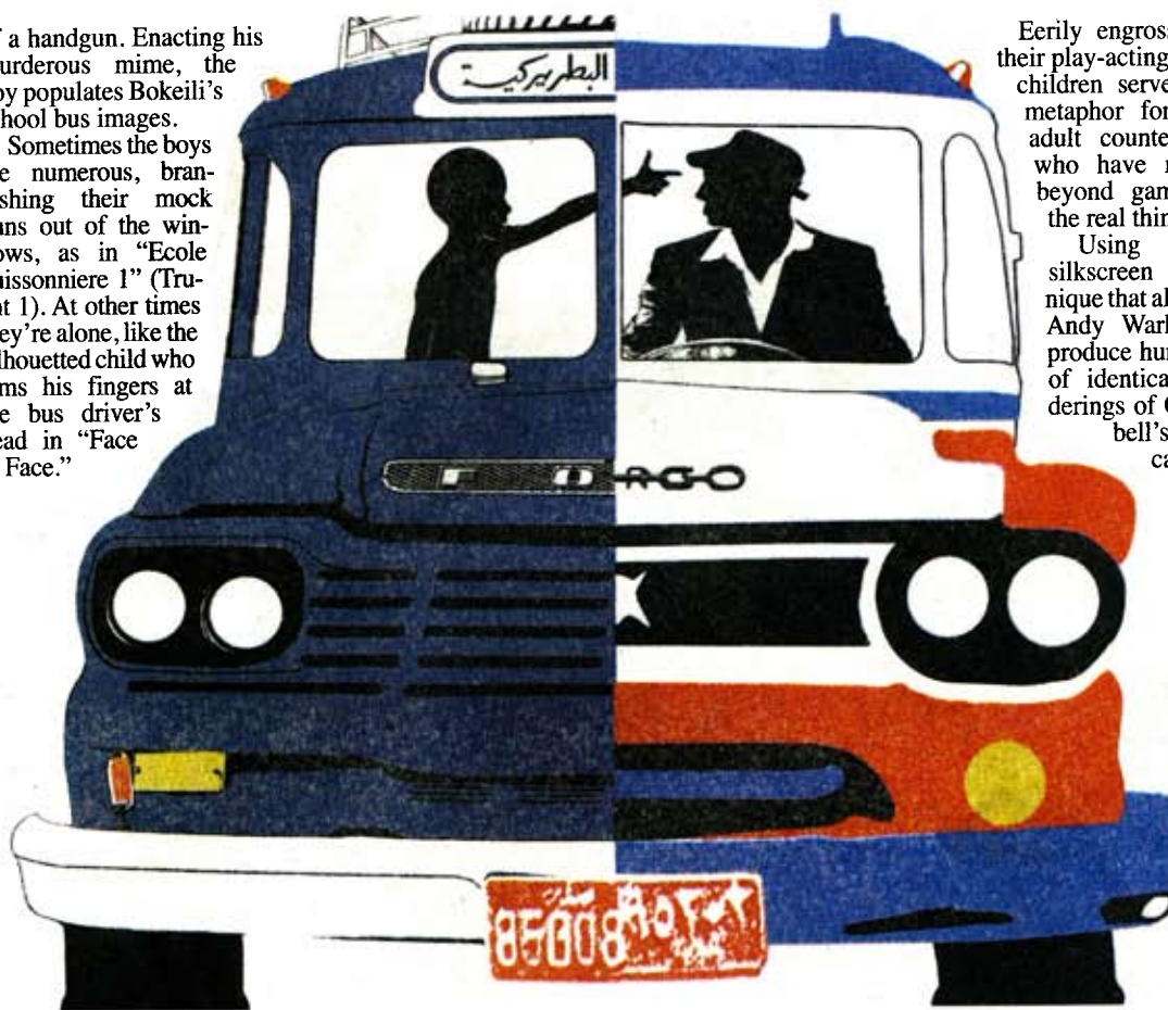
"Face to face" 115x97.

Sometimes the boys are numerous, brandishing their mock guns out of the windows, as in "Ecole buissonniere 1" (Truant 1). At other times they're alone, like the silhouetted child who aims his fingers at the bus driver's head in "Face to Face."