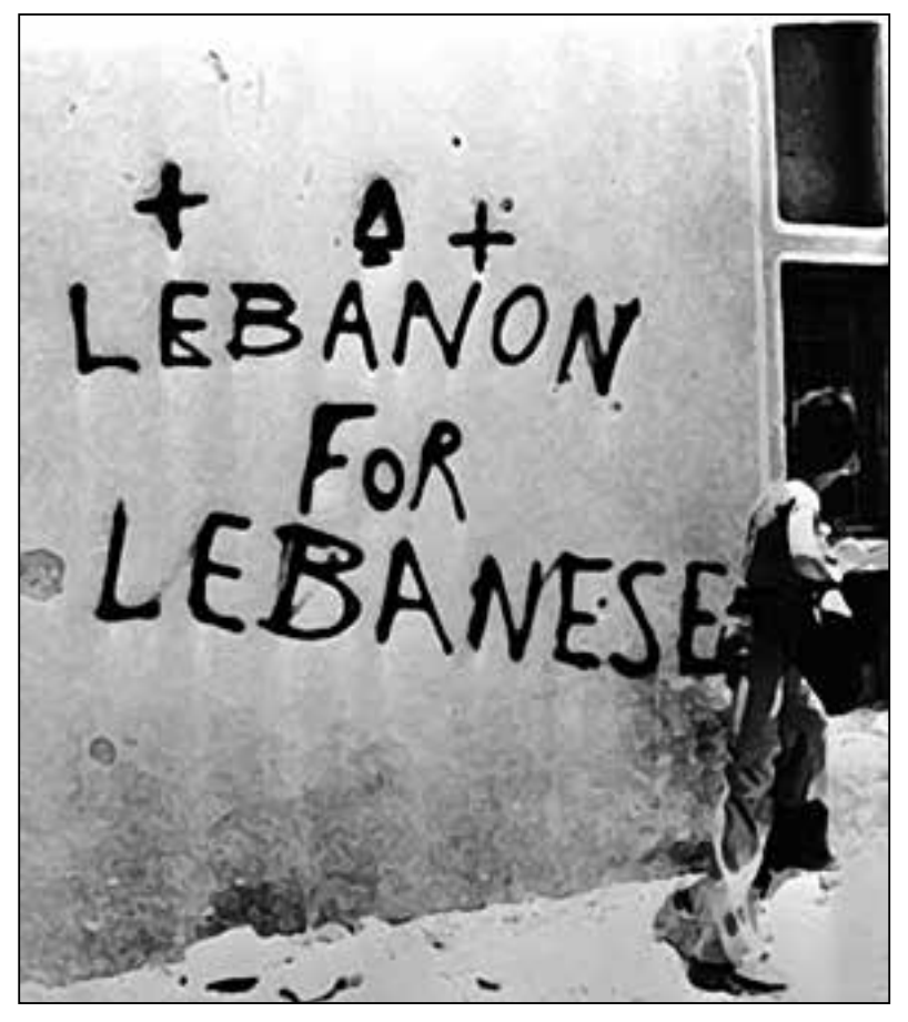
A 1970s-era example of public sentiment regarding "settlement" in Lebanon.

to sharing their country, its resources and its citizenship with a group of refugees. Those plotting such an outcome would either be the group of refugees itself or a third party seeking to compel a refugee community to decline to return home. Thus, it could reasonably be stated that in the minds of the Lebanese, settlement indicates some form of coercion or duress, while