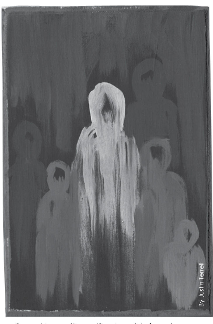
"I was at home with my wife, when a lot of people—men, women and children—suddenly burst inside and demanded a place to sleep."

Syrians in Lebanon were no longer welcome, especially in areas that had originally greeted them warmly or were at least indifferent to their sudden presence. As stated above, this progressive tendency toward "unwelcoming" not