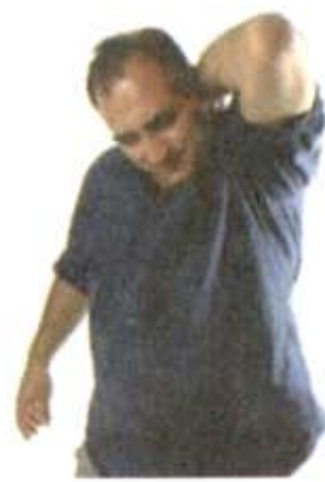
Nahas insists his installation "does not date from today."

Such catastrophic circumstances collectively inspire Nahas' work. Just as the catastrophes of war may shape the psychic consciousness of an artist, these very same catastrophes shape the concrete circumstances of artistic production. Once taken in by Nahas' depictions of abstract and intimate violence, it